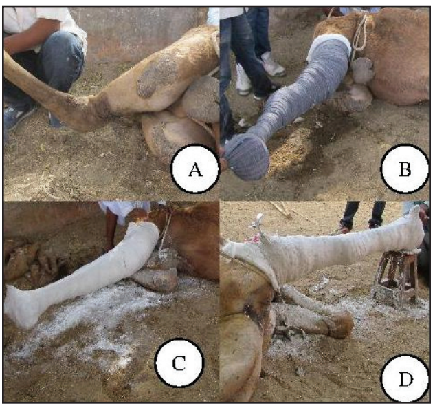
Fig 2. (A) A compound fracture at distal end of tibia in camel. (B) Padding with cotton and niwar bandage after reduction. (C) Fractured tibia was immobilised with plaster of Paris cast using bamboo splint. (D) Immobilisation of fractured radius ulna with plaster of Paris cast using Aluminium splint.

Mandible fracture may be up to 55 per cent of clinical cases (Gahlot and Chouhan, 1994). In the present study it was recorded to be (44.32%). Fracture of mandible is the most commonly observed fractures in camels. Bilateral or unilateral (rarely) mandibular fractures are common in male camel, that occur across the first premolars or quite cranial or caudal to this point in inter-dental space. These fractures are usually seen during the rutting season. In this season, males become quite active, vicious and tend to bite each other, leading to abnormal stress on the mandible which can cause fracture (Gahlot, 2000). Standard Interdental wiring technique using 2 mm copper wire is the method of choice to repair such fractures. The technique is simple, convenient and economical. The fracture site which needs repeated re-adjustment of the wires to keep the fractured